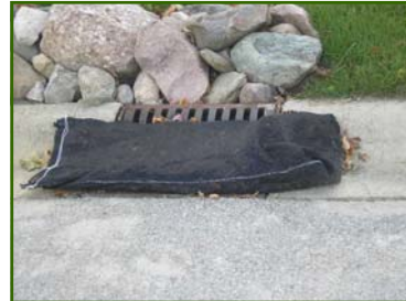
Mesh bag, filled with # 2 stone and large mulch